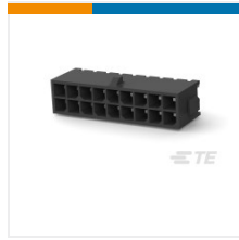
18P MICRO MNL ASSY, VRT, HDR, LF 4-794630-8