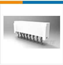
1.25MM FFC POST PLATED V 26P 2-84534-6