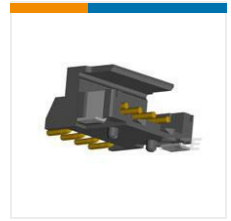
CT BOX HDR H SMT 3P O/TAPE NAT 1-292173-3